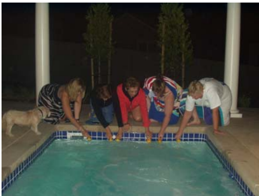
Rubber ducky races get set ...

The group headed home for a special dinner paired of course with the wines purchased during the adventure. After dinner the loser of the rubber ducky race had to clear and wash up the dishes. I think the dog actually won and to this day searches for ducks every chance she gets. A spa treatment was enjoyed by all to be fresh and ready for the morning bikeride down to the Fish Hatchery and back followed by lunch in historic Folsom.