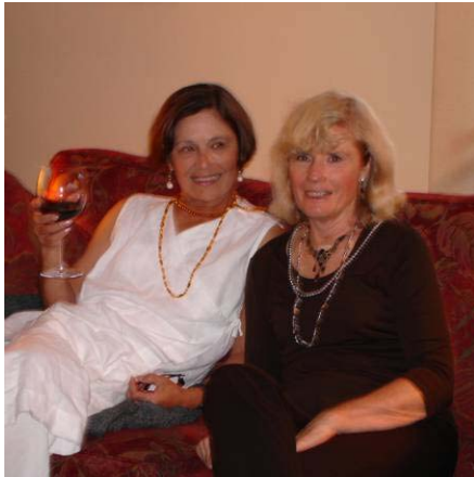
Giants TGIF at Ausiellos Tavern

Two beautiful Inskier ladies enjoying a night out