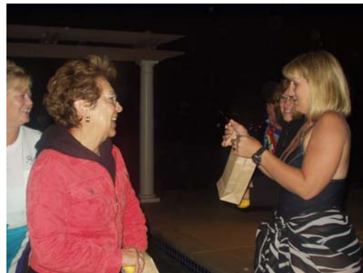
And the winner (loser) is ...

See Inskier photos at www.inskiers.smugmug.com/