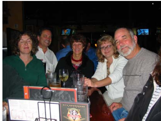
BJ's Happy Hour