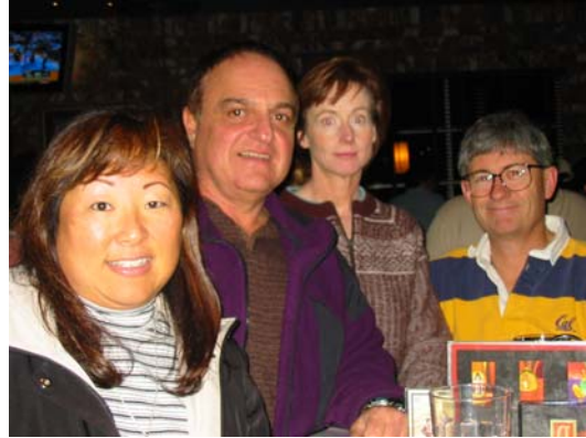
BJ's happy Hour

Friday, Dec. 16th - Anyone interested in hosting a Happy Hour. Please if anyone is interested respond to this email.