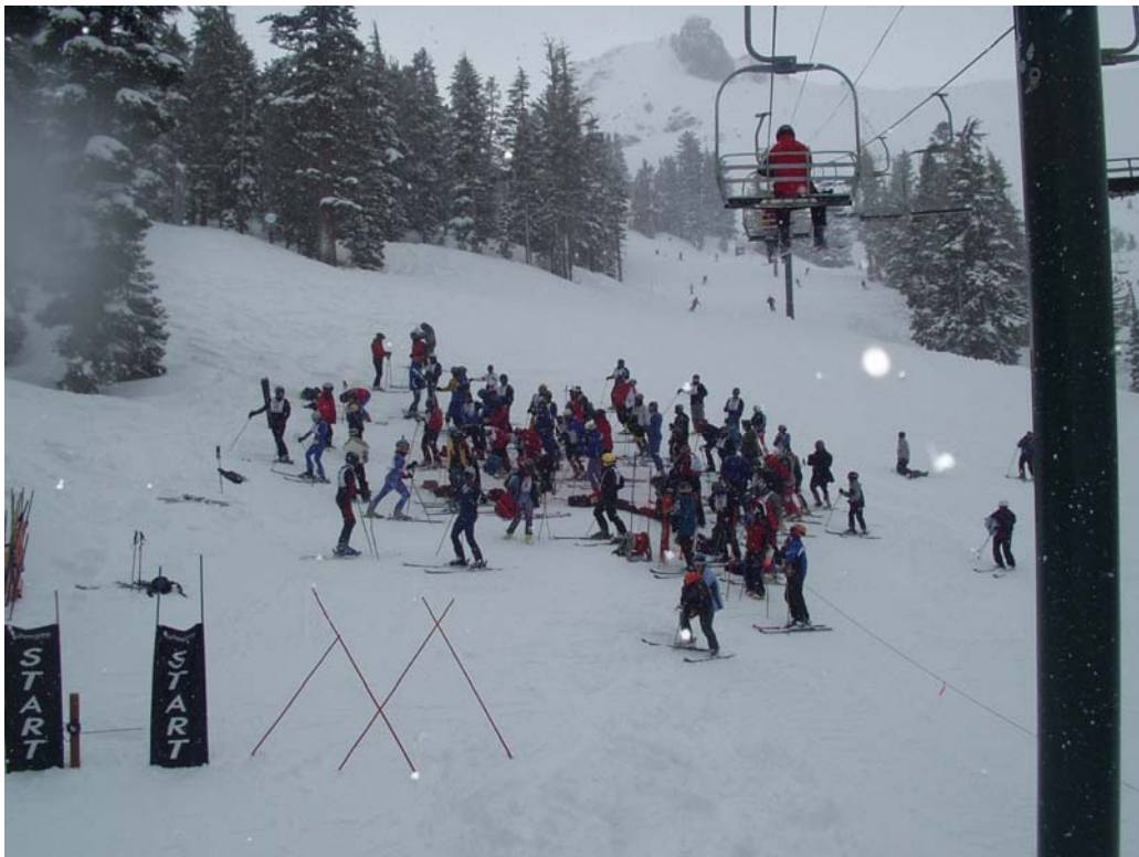
Racers waiting to start, Kirkwood

PS> Watch for those Inskier e-vent e-mails and be kind to the event host/sponsor and our treasurer by responding and taking care of business promptly